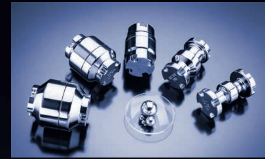
Selection of grinding jars and balls